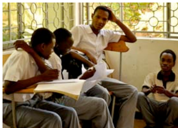
Students at the RAIDA School