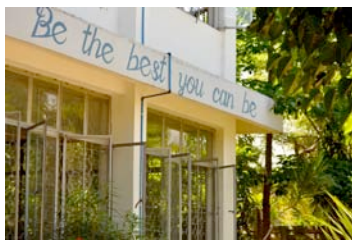
The motto of RAIDA School