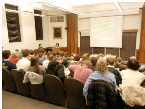
Excellence in Teaching Symposium keynote speech