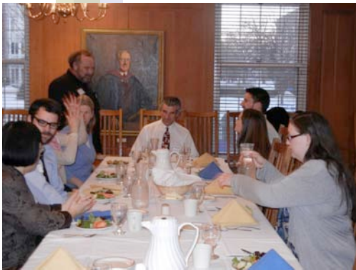
Excellence in Teaching Symposium dinner